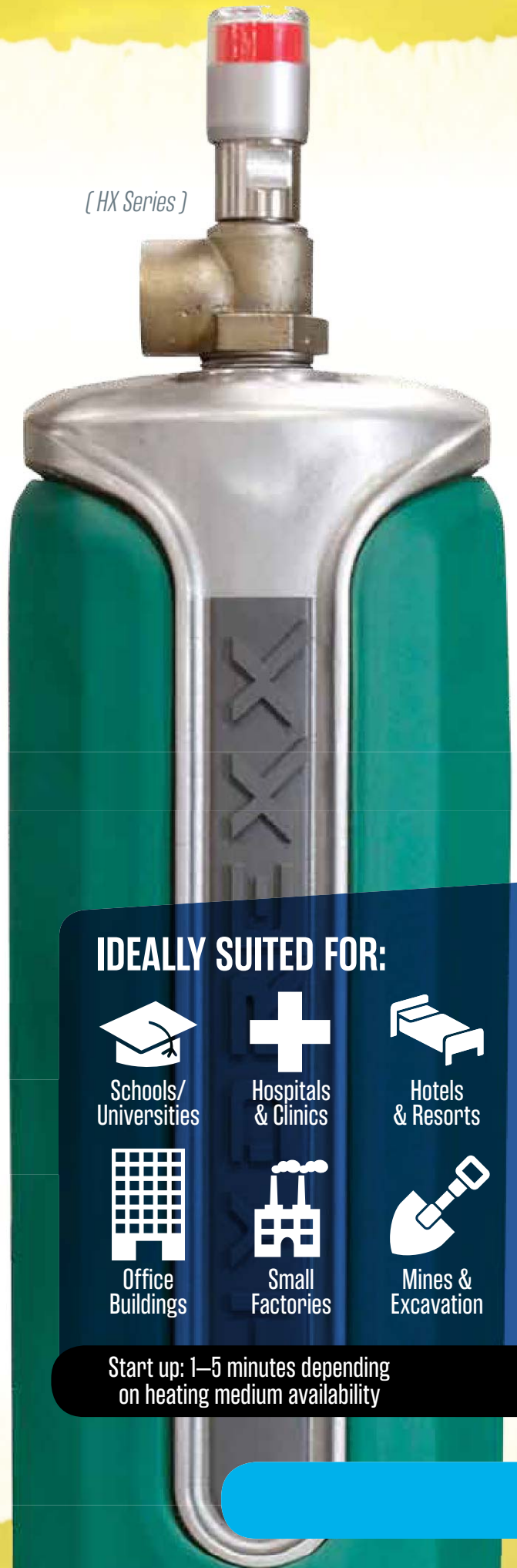
[ HX Series ]