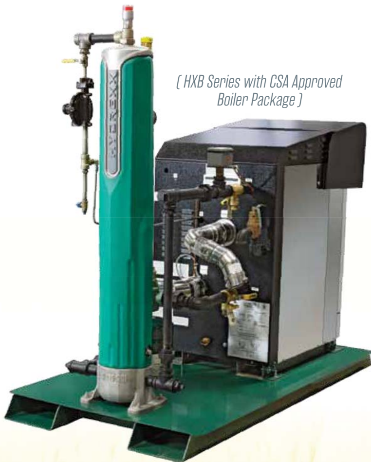
[ HXB Series with CSA Approved Boiler Package ]

The HXB Series is a base-plate mounted package with an integral dedicated hydronic boiler installed at the factory. The HXB Series is pre-piped, pre-wired and ready for installation. The LPG vapor fired hydronic boiler provided with the HXB Series heats the water to the desired preset temperature. The water is contained within a closed loop system and circulated by an integral pump. Hydronic boilers are efficient, economical and a proven solution for industrial applications worldwide.